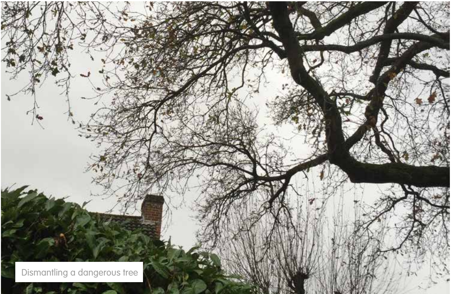
Dismantling a dangerous tree