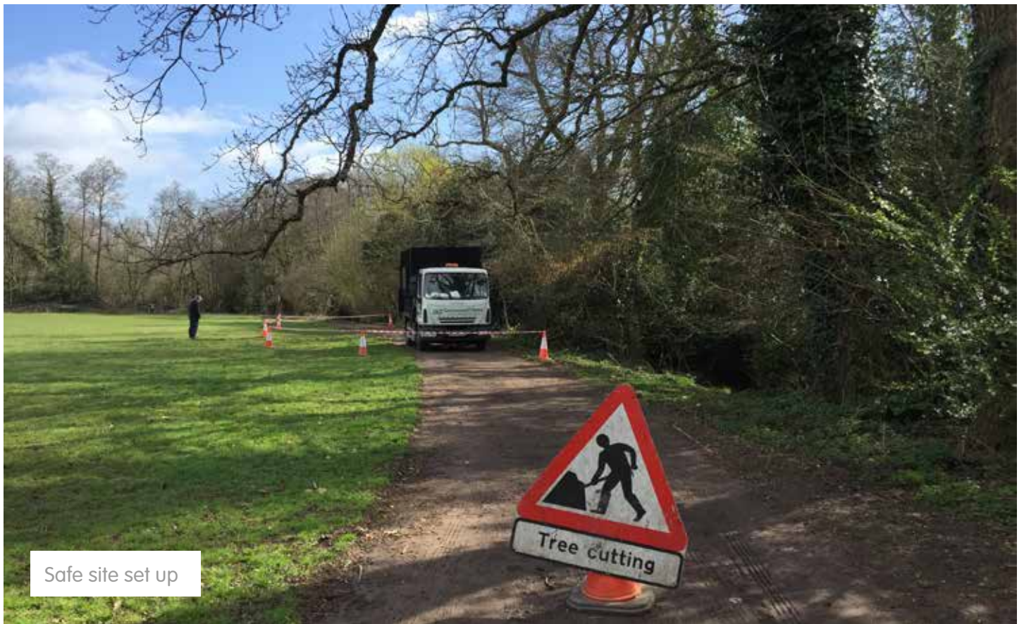
Safe site set up